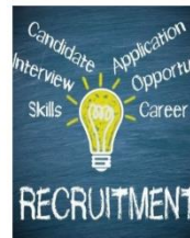
How to become a recruitment apprentice