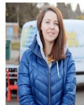
How to become a business owner