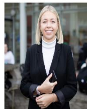
How to become a business development intern

https://www.bbc.co.uk/bitesize/articles/z6m9hbk