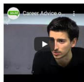
Becoming an Entrepreneur