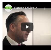
Becoming a CEO