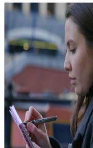
How to become a writer

https://www.bbc.co.uk/bitesize/articles/z482382