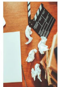
How to be a screenwriter