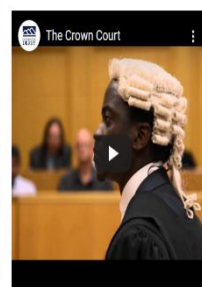
Roles in the crown court