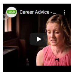
Visitor Experience at the V&A Museum