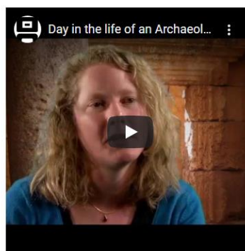
Day in the life of an archeologist