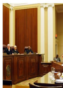
How to become a solicitor

https://www.ucas.com/ucas/after-gcses/find-career-ideas/explore-jobs/job-profile/solicitor