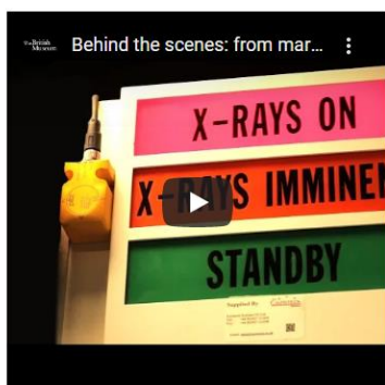
Jobs at the British Museum