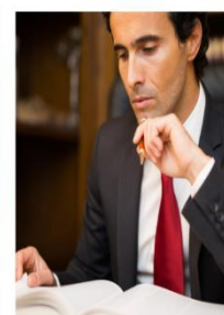
Steps to solicitor