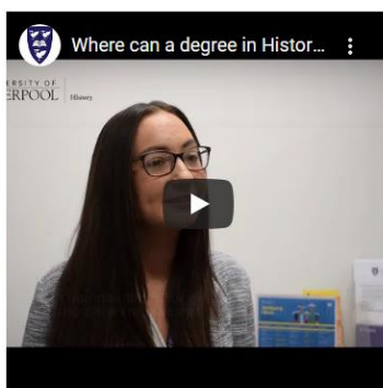
Where a History degree can take you