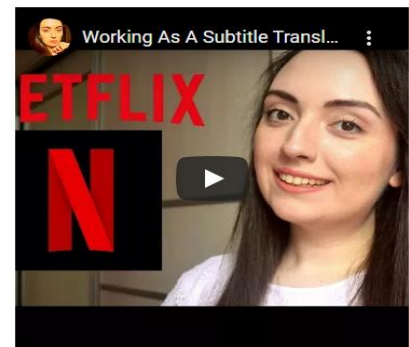
Working As A Subtitle Translator for Netflix And My Career Journey

https://youtu.be/MMmOLN5zBLY https://youtu.be/os2K6p1r7k https://youtu.be/mjQzSharoAU