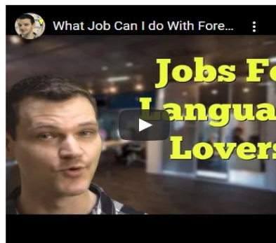
What jobs can I do if I like languages?