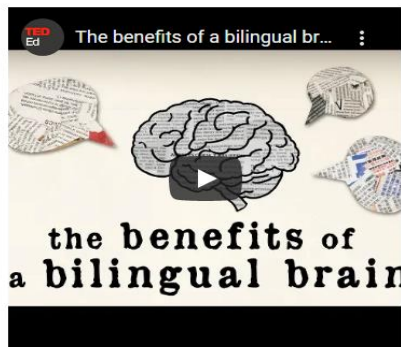
The benefits of being bilingual