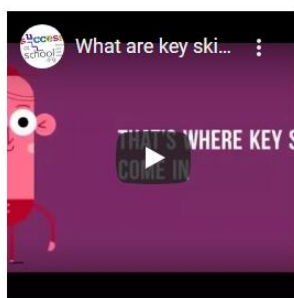
What are key skills?

https://youtu.be/x4alDY3hTHQ https://youtu.be/pQ29V-qdfUM